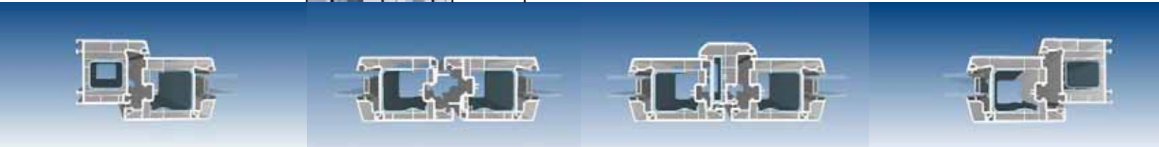
Horizontal cross section of 3-panel door (inswing)